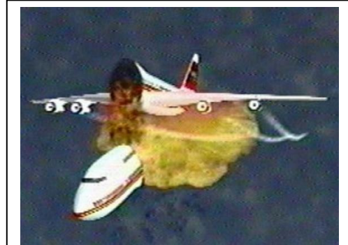
Bill Clinton’s CIA lied about the destruction of TWA 800 by producing a video showing the huge nose-less jet ascending like a rocket, an aeronautical impossibility.

In the crash of TWA Flight 800, which resulted in the deaths of 230 passengers and crew on July 17, 1996, federal “investigators” and the FBI and CIA blamed a fuel tank explosion when eyewitnesses saw missiles hit the plane. To discredit them, the CIA produced a video showing the huge nose-less jet ascending like a rocket, an aeronautical impossibility, supposedly after the fuel tank exploded.