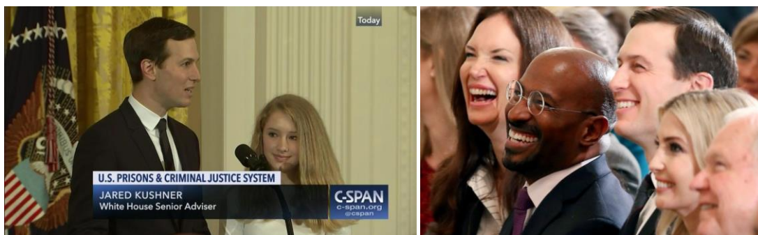
Right: Van Jones, Jared Kushner and Ivanka Trump in the White House

In the latest development, Trump has replaced his campaign manager, a move that reflects his desperation as the November 3 election approaches. That leaves his liberal son-in-law, Jared Kushner , in charge. Kushner was a former business partner with George Soros and brought “former” communist Van Jones into the White House to work on “criminal justice reform” and “police reform.”