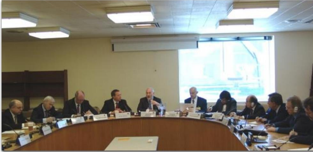
This is a photo of the SI Commission on Global Financial Issues meeting in New York on March 31, 2009. Stiglitz is in the middle.

For his part, Stiglitz wants to generate hundreds of billions of dollars in what he calls “global greenbacks.” This is a new form of “global money,” he says, constituting one of several “innovative approaches to financing economic development [which] need to be tested.” The phrase “innovative approaches” or “innovative sources” is code language for global taxation schemes.