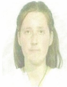
Photograph taken in 1998