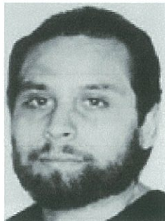
Photograph retouched in 2004