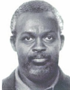
Photograph age enhanced in 2004 to age 60