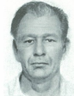
Photograph age enhanced in 2004 to age 59