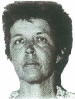
Photograph taken in 1985