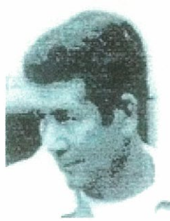
Photograph taken in 1984