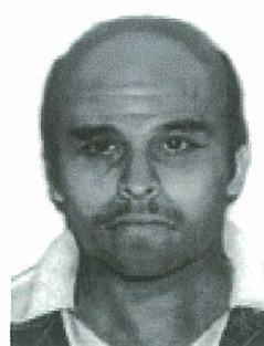
Computer Age Enhanced Photograph