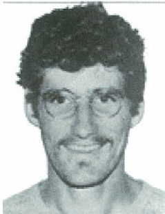
Photograph taken in 1969