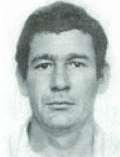
Photographs taken in 1984