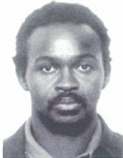
Photograph taken in 1971 at age 27