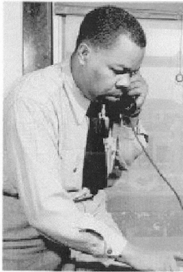
Frank Marshall Davis