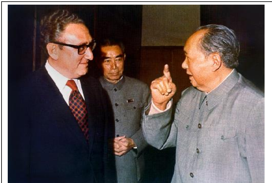
Kissinger’s “China Opening” to the greatest mass murderer in history, Mao, was comparable to Neville Chamberlain’s “Peace in Our Time” overture to Hitler.

As a result of this betrayal, 23 million people with a Democratic form of government on the island of