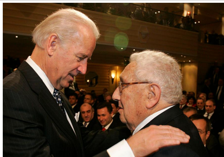
Biden greets Kissinger at the Munich Security Conference.

The House has an obligation to make the case that China Joe has been functioning as an agent of influence for China, Russia, and other nations funneling cash to Hunter.