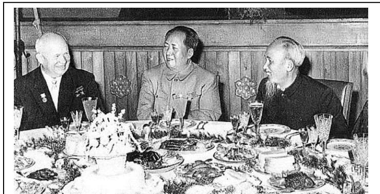
Nikita Khrushchev of Russia, Mao Zedong of China, and Ho Chi Minh of Vietnam are pictured. Kissinger's "China Opening" consigned Free China on Taiwan to communist enslavement. His "Peace Accords" turned Vietnam over to the communists.