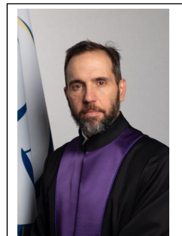
U.N.-trained “Special Counsel” Jack Smith, who worked for Barack Obama, is trying to imprison former President Trump. He is doing China’s bidding.

One charge, if we are to believe the media, is that Trump mishandled some documents in his possession dealing with nuclear issues. He was entitled to those under the Presidential Records Act. Yet the Biden Administration revealed one of the nation’s most highly classified secrets -- the number of nuclear weapons in the U.S. stockpile. Such a disclosure works only to the benefit of America’s enemies, such as China and Russia, who keep their nuclear information a state secret.