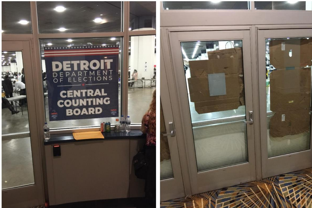
Photo evidence of alleged vote fraud operation in Detroit, Michigan. "They placed cardboard on the windows so legally qualified challengers could not see into the room," said the eyewitness. "The tables you can see in the distance are too far away to determine what is going on. This process went on for hours like this. It was even worse in Pennsylvania." He added, "The Democrats placed rather unusual looking 'police officers' to bar the door. Some did not have badges. One had long hair. He couldn't be a cop."