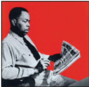
Frank Marshall Davis

These include a Hawaiian "poet" named Frank Marshall Davis (whose identity Obama tried to hide when referencing him in his book). Davis had some considerable influence on the young Obama when they both lived in Hawaii. Obama himself says as much in his book, referring to his early mentor merely as "Frank." It took some recent digging to confirm that Davis was in fact that influence. Did Obama really think that the very act of hiding the man's true identity would make no one curious?