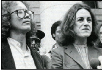
William Ayers and Bernadine Dohrn

shoeleather for up-to-date sleuthing, including a trip to Chicago.