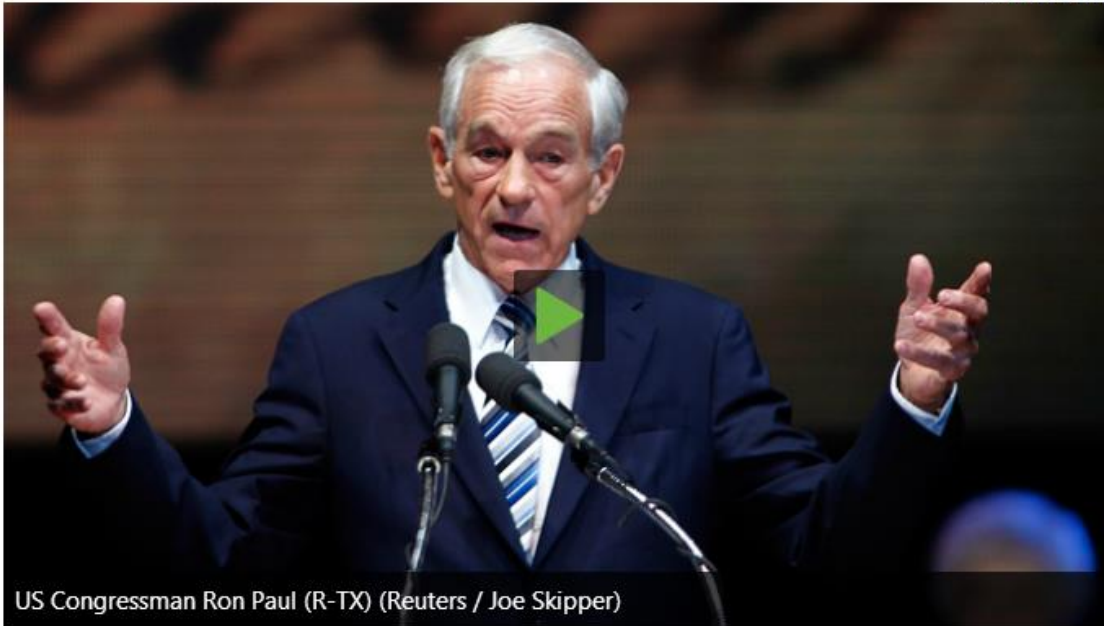
US Congressman Ron Paul (R-TX)

Ron Paul is a favorite of the Kremlin propaganda channel