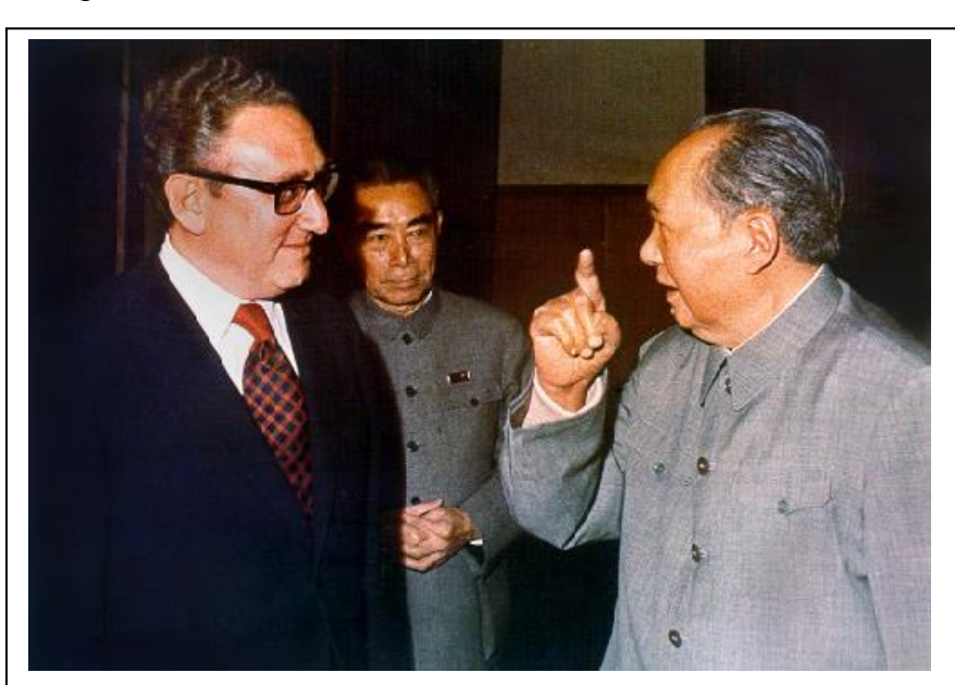
Kissinger's "China Opening" to the greatest mass murderer in history, Mao, was comparable to Neville Chamberlain's "Peace in Our Time" overture to Hitler.

As a result of this betrayal, 23 million people with a Democratic form of government on the island of