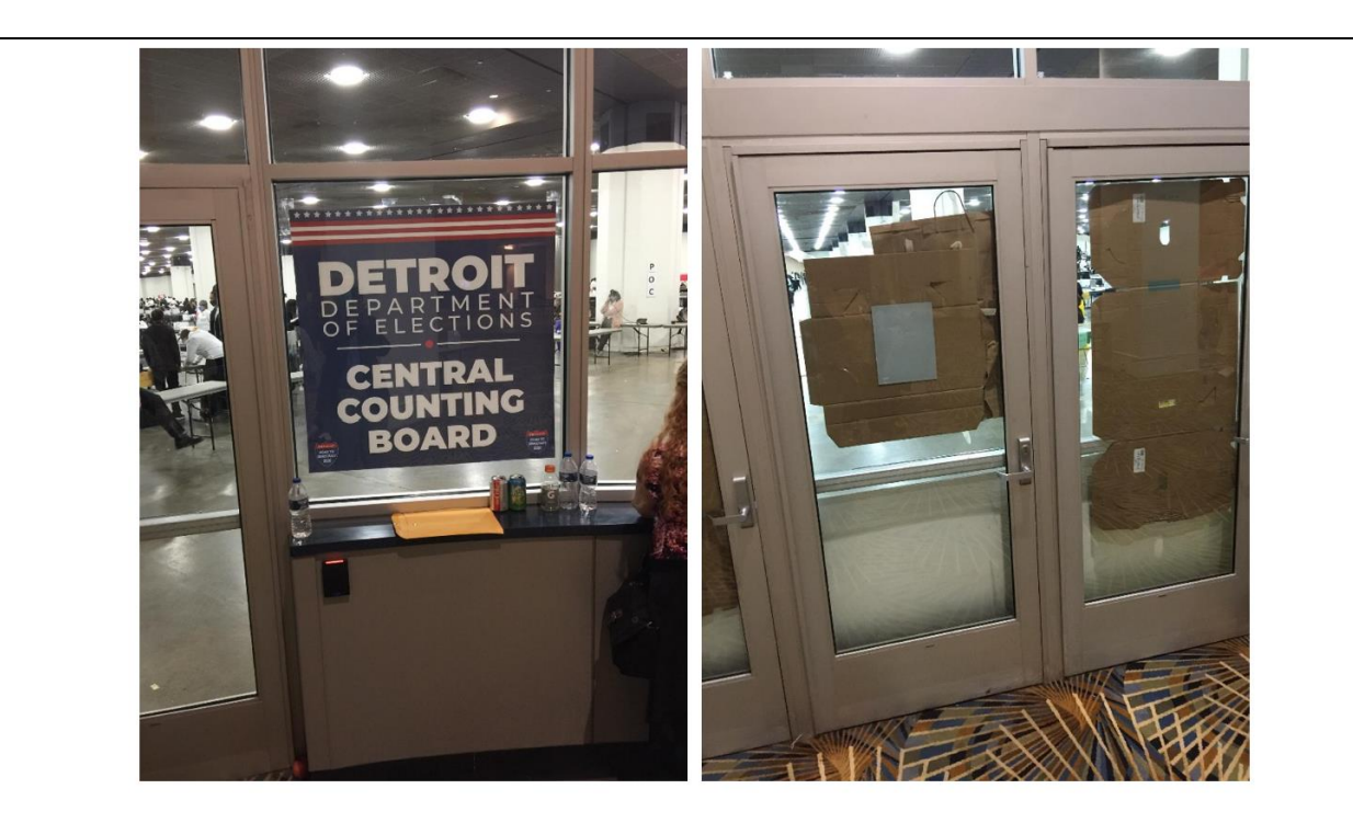
Photo evidence of alleged vote fraud operation in Detroit, Michigan. "They placed cardboard on the windows so legally qualified challengers could not see into the room," said the eyewitness. "The tables you can see in the distance are too far away to determine what is going on. This process went on for hours like this. It was even worse in Pennsylvania." He added, "The Democrats placed rather unusual looking 'police officers' to bar the door. Some did not have badges. One had long hair. He couldn't be a cop."