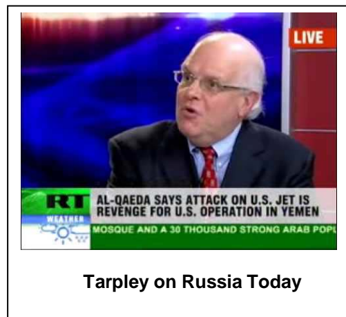
Tarpley on Russia Today

Which raises the question: if U.S. officials orchestrated 9/11, in order to go to war in the Middle East, why couldn't these same officials have planted weapons of mass destruction in Iraq in order to justify the overthrow of the Saddam Hussein regime? That would have been relatively easy, compared to the complicated and elaborate schemes required to strike the World Trade Center and the Pentagon, and then to blame the attacks on Muslim Arabs hijacking U.S. commercial aircraft.