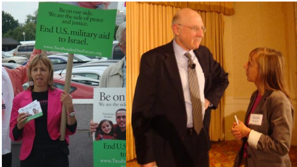
Medea Benjamin and Barry Posen (right) at a Charles Koch Institute forum.

This is a story of how politics makes strange bedfellows. Medea Benjamin of Code Pink is in bed with the Koch Brothers, in an emerging alliance designed to make it acceptable for Iran to develop nuclear weapons. The stakes are high for the U.S. but especially for Israel.