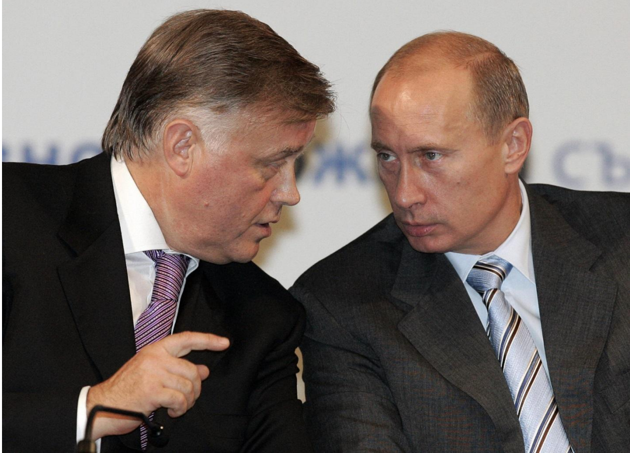
Yakunin and Putin

Today, Europe is a major Russian target, and Germany is where Russian operations are most apparent. Chancellor Angela Merkel has been functioning as a virtual agent of Putin's Russia, but she is hardly alone. Yakunin's group staged a "Europe: Lost in Translation" conference in Berlin in May, conducted in partnership with the German-Russian Forum and its new chairman, the former Social Democratic Party leader Matthias Platzeck.