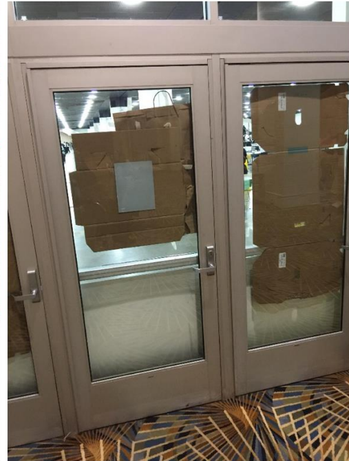
Photo evidence of alleged vote fraud operation in Detroit, Michigan.