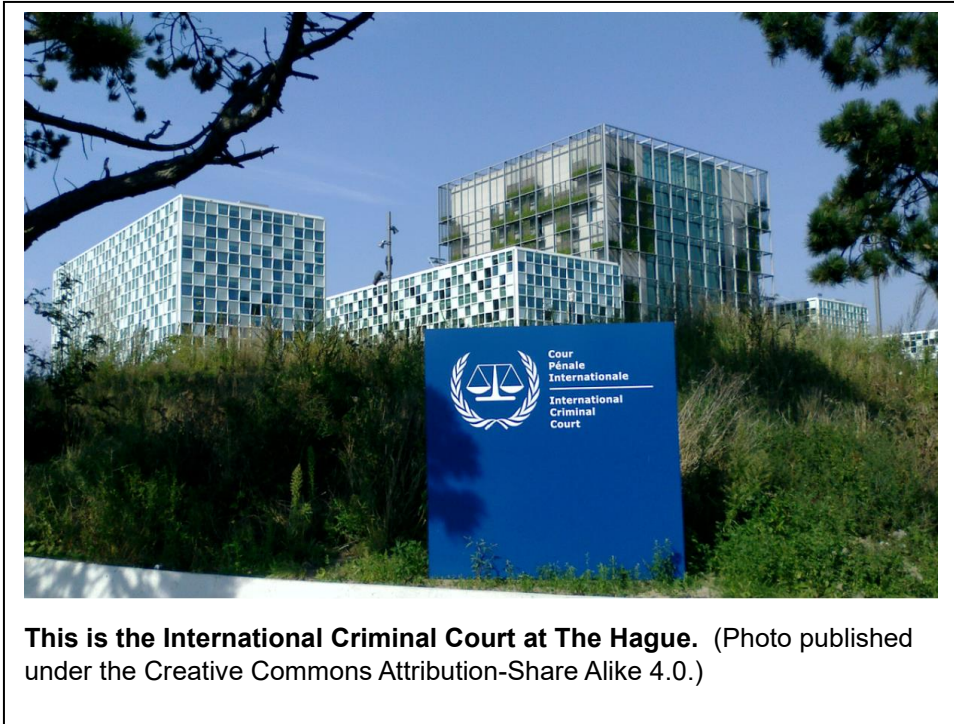
This is the International Criminal Court at The Hague.

When Jack Smith became a "Specialist Prosecutor" for the Kosovo Tribunal, a project of the European Union, he "signed a solemn declaration that he would exercise his