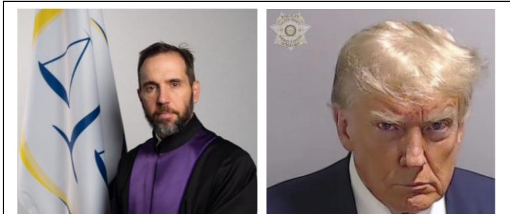
United Nations-trained lawyer Jack Smith (left) was photographed wearing the global garb of an international court. His prosecutions of Trump are laying the groundwork for a U.N campaign to jail the former president in a prison cell near The Hague, Netherlands. Trump, in a booking photo, is also being persecuted by Fulton County GA District Attorney Fani Willis.

Former Reagan Attorney General Ed Meese submitted a friend-of-the-court brief on December 20 to the Supreme Court explaining that “Special Counsel” Jack Smith’s appointment was illegal and unconstitutional. “Essentially,” reported Breitbart news, “U.S. Attorney General Merrick Garland improperly appointed Smith to an office that does not exist with authority Garland does not possess.”